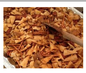
Diane's Wicked Chex Mix

Mix the following together in large roasting pan, then combine with above ingredients. Stir and roast