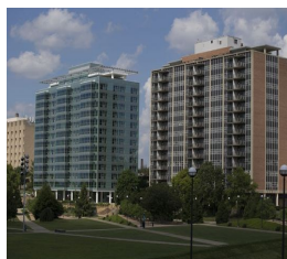
Scioto Hall on right.